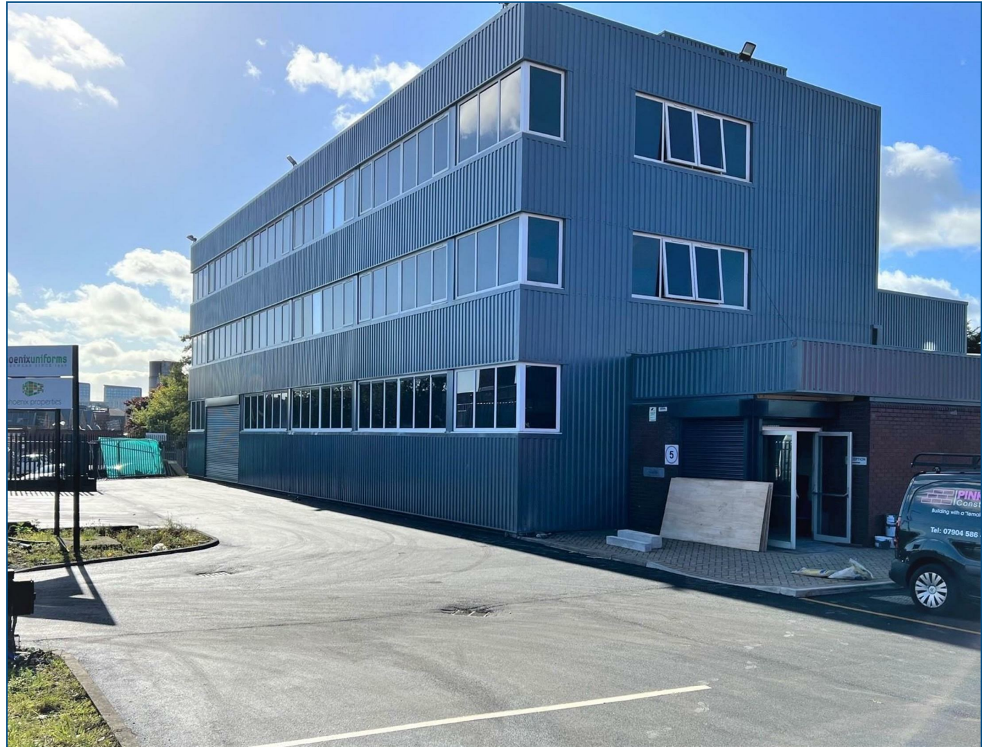
Call House, Enfield Street, LS7 1RF